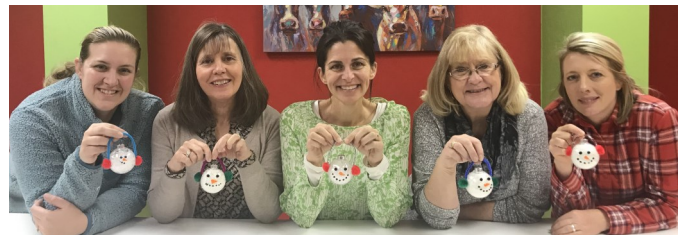
Another fun and successful lunchtime craft.